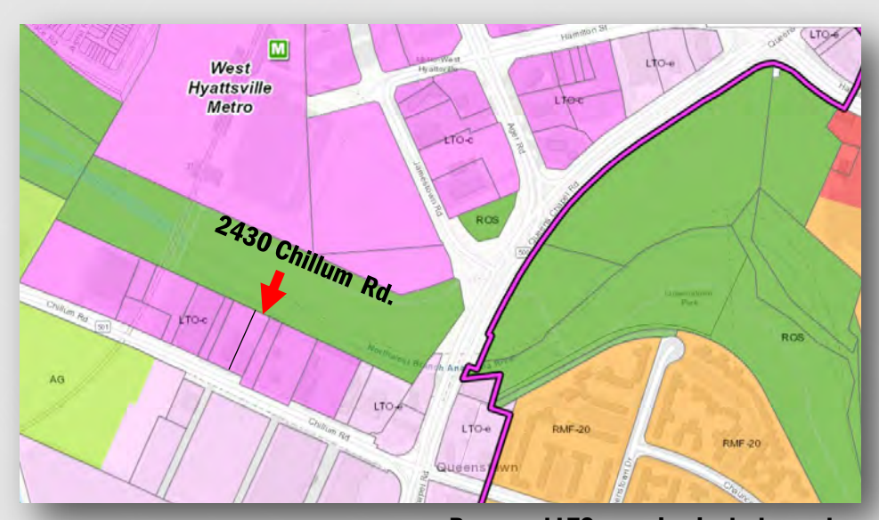
Proposed LTO-c zoning in dark purple