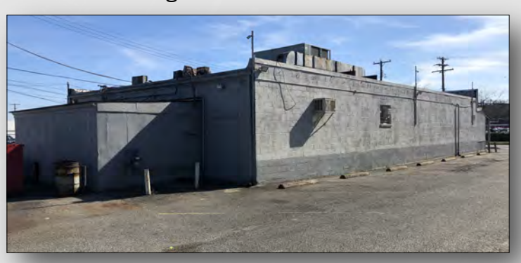
Total of 34 parking spaces available.

This is truly a value-add opportunity as a new owner can continue to run business knowing land value will grow over time, providing a future exit