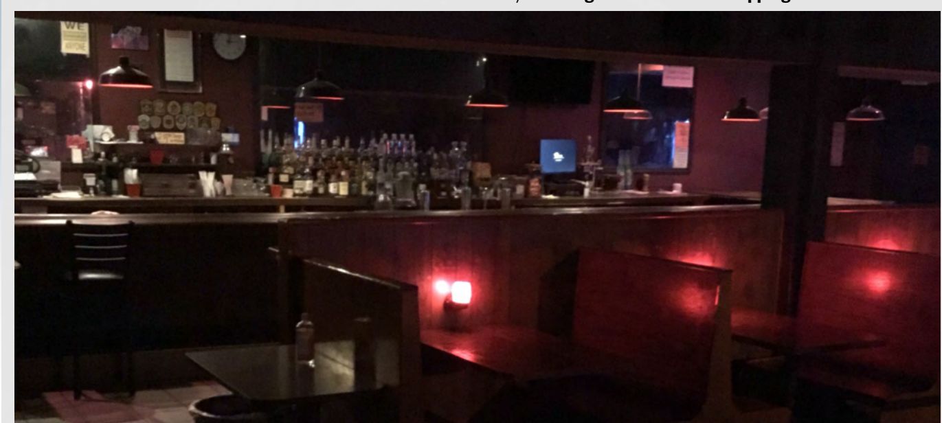
Bar and seating area.