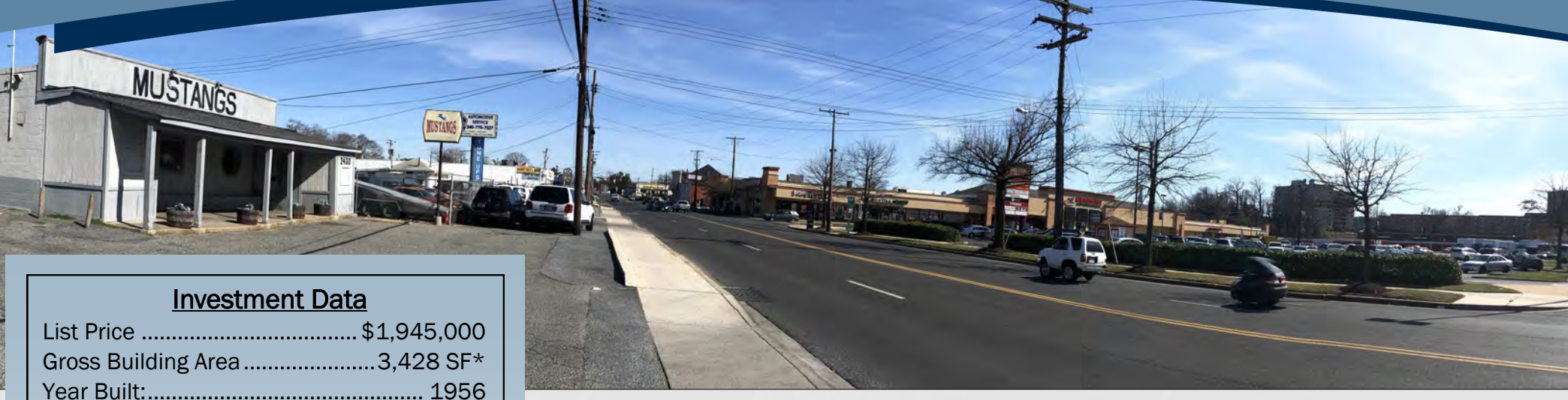
Street view of Chillum Rd., with MegaMart anchored shopping center across street.