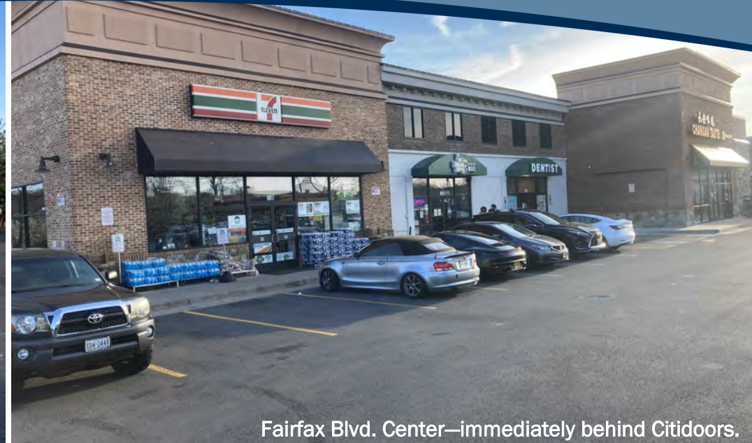
Fairfax Blvd. Center—immediately behind Citidoors.