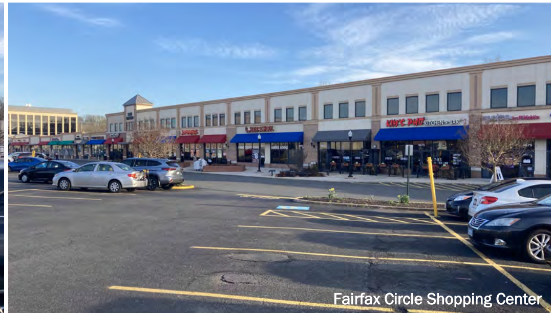
Fairfax Circle Shopping Center